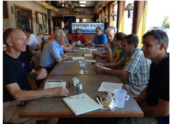
Flying W resort