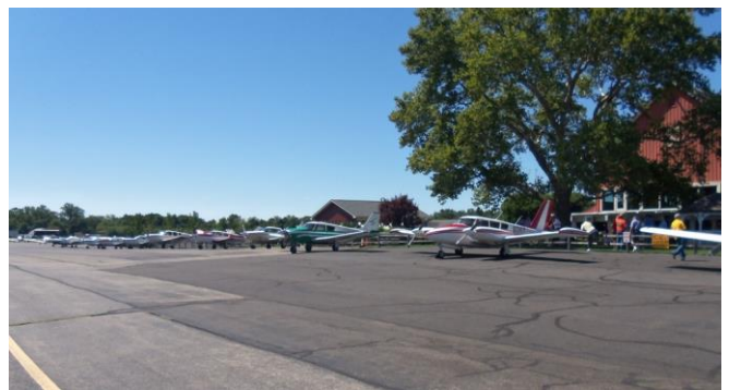
Comanche flight line