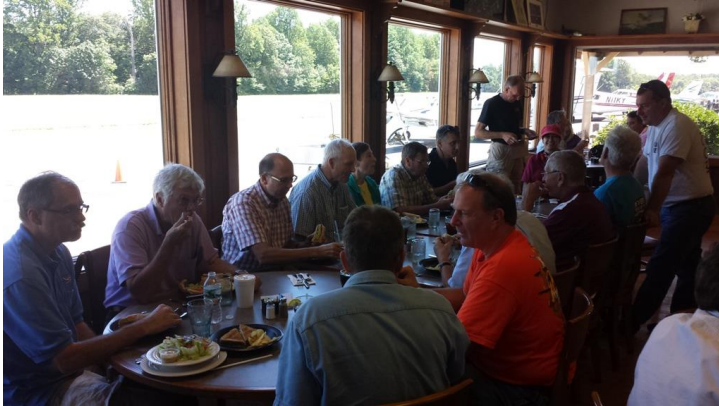
great food enjoyed by all