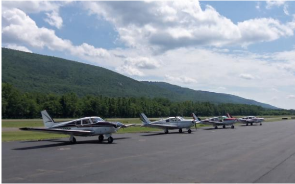
Comanches at Resnick

Once again the weather gods conspired against us for our fly-in at Ellenville, NY. This time a stalled tropical depression left lousy flying weather all up and down the east coast so the original dates were scrubbed and an alternate date the following Sunday became the new plan. The weather turned out beautiful, with temperatures in the mid 80's after a week of high 90's. Four Comanches flew in, plus another couple who drove from nearby, for a total of 10 in attendance. There were others who could not attend because of prior commitments.