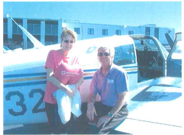
Angel Flight originating at Rochester NY

Angel Flight Northeast, in Lawrence, Mass, is the contact organization for prospective passengers for Delaware to New York and into New England – the same general area as for ICS-NE. The office staff gathers all data – name, contact information, doctor, needed flight timing – and lists each flight on the web site for pilots to sign up. Pilots click on flights they want to fly and receive the documentation by e-mail. The pilot and patient talk to each other on the phone, and then meet at the departure airport, fill out some paperwork and fly to the destination. All flights are on an IFR flight plan and use the preferential NGF call sign. In some cases there is a connecting flight with another pilot taking the patient to a further destination. After the flight the pilot files a report which includes the time and cost of the entire trip. Angel Flight then provides documentation for a charitable tax deduction.