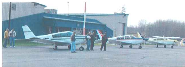
As always, early arrivals get the best parking spots

On December 6, 2008, we held a luncheon fly-in at Delaware Airpark (33N), Dover Delaware. It was a beautiful VFR day, with little wind, and just the minor problem of a Presidential TFR over Philadelphia, 50 miles to the north. We had a great turnout, though, with thirteen planes and nearly 20 members making their way to join us. The TFR was a little reminder of the influence DC airspace has on most of our flying. Don't forget that "Navigating the DC ADIZ" training will be mandatory in February if you fly within 60 nm of the DCA VOR, and is available online from the FAA.