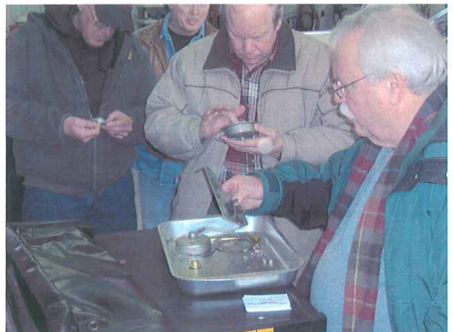
Members look at expensive fuel selector parts that corrode unseen.