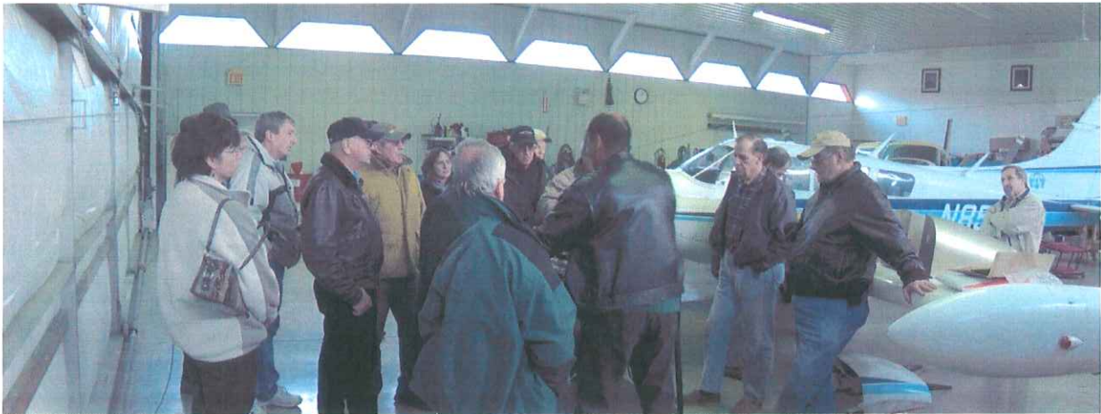
An interested crowd learns about Comanche fuel system maintenance

As seen in the photos below, participant at the December Delaware fly-in got a down and dirty look at fuel cell installation and system components. Drain those sumps in this cold weather!