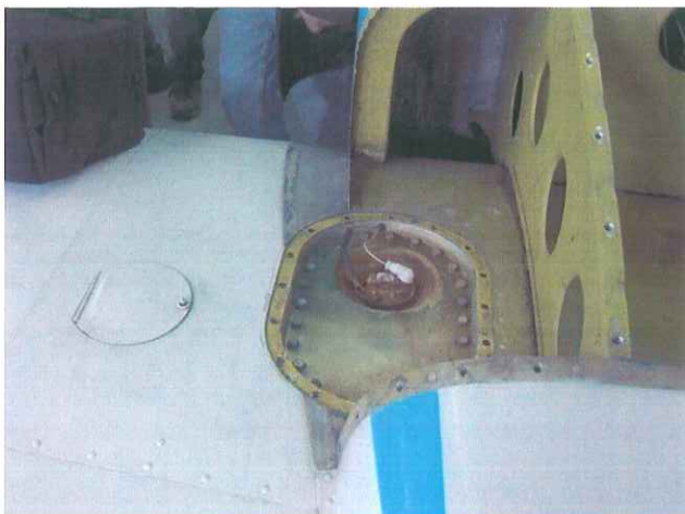
A common spot for corrosion to start