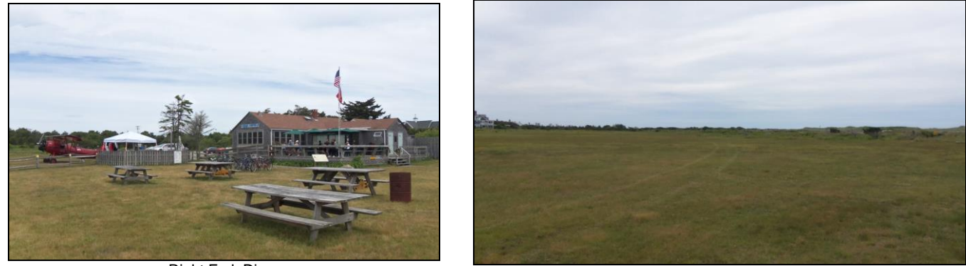
Right Fork Diner

Katama Airpark is a grass strip airport on the southeast corner of Martha's Vineyard, just to the east of the KMVY Class D airspace. There is parking near the FBO office and Right Fork Diner at the north end of Runway 3-21, and a taxiway to the beach parking at the south end. From there it is only a few steps the one of the finest beaches on the island, with sparkling sands and Atlantic Ocean surf. Bring your families, your beach toys, and (for the brave) your swimsuits!